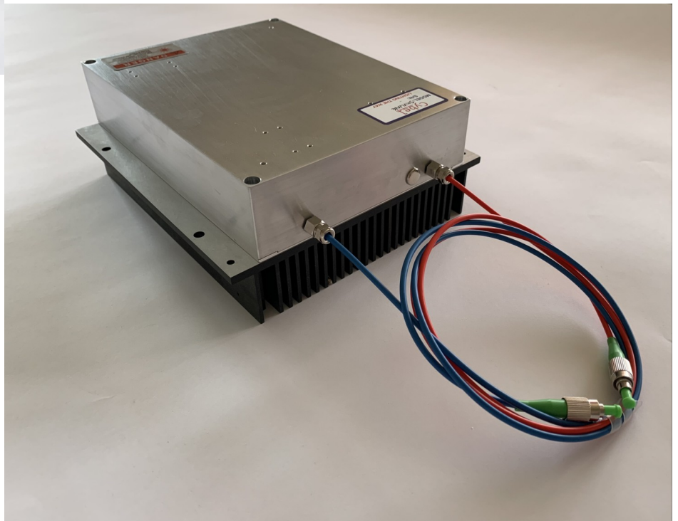
GLOW Heat Sink for SKYLINE module

GLOW heat sink dissipates maximum power of 170W and will work efficiently when used with a fan of 800 LMF ( Linear Feet per Minute ).