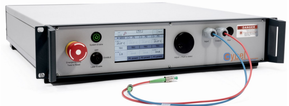
Turn-Key Rack Mount Benchtop