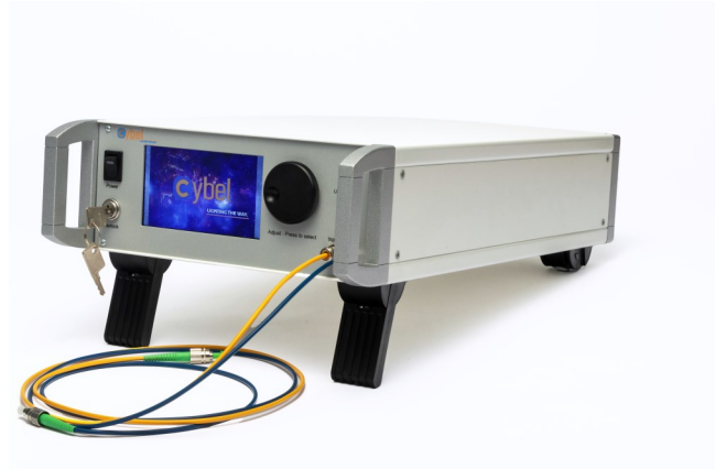
CIRTA - 1300 Turn-key half-benchtop - 9.5" 2U